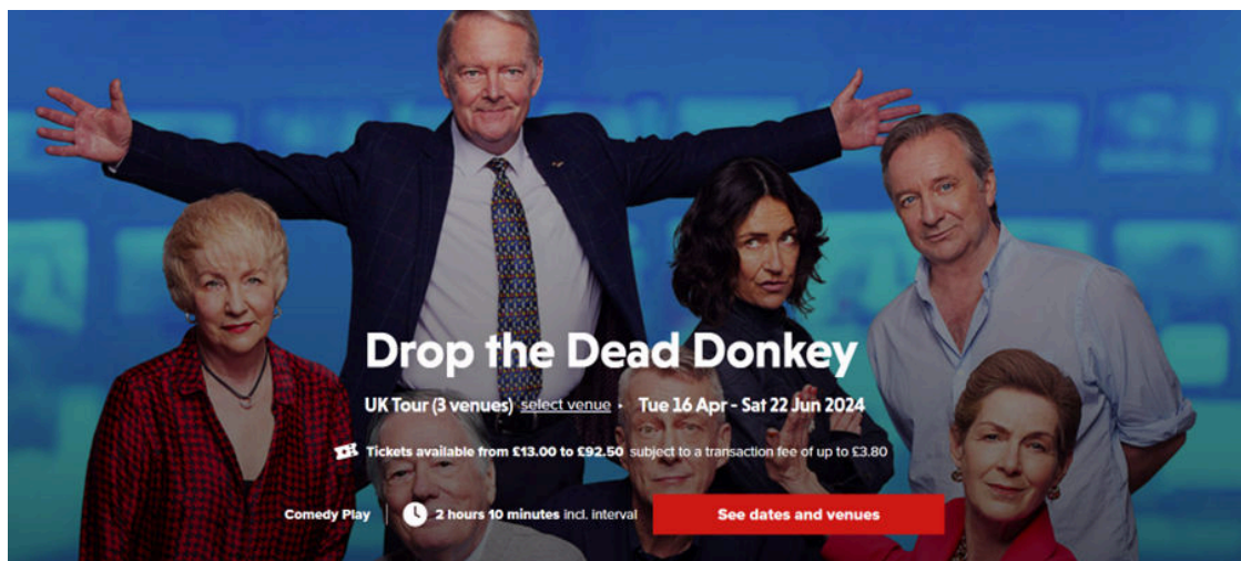
for tickets https://www.atgtickets.com/shows/drop-the-dead-donkey/